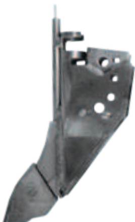
680-ASY-1000P 680-HLD-1000P (SHOWN)