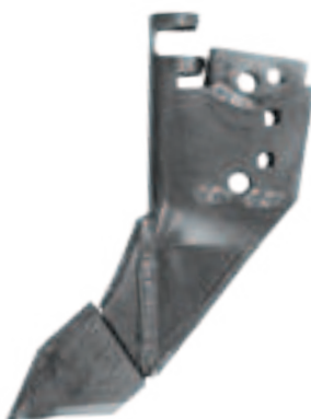
680-ASY-1000 680-HLD-1000 (SHOWN)