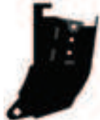
EDGE-ON BOURGAULT PHD* MORRIS MAXIM 673-HLD-2080